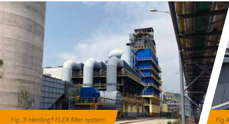
Fig. 3: Herding® FLEX filter system