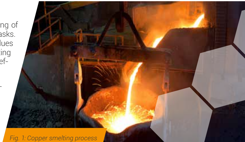
Fig. 1: Copper smelting process

Throughout the whole „copper matte handling process“ in the converter, extraction at multiple points is required. To ensure efficient filtration, the process is vacuumed here at a total of three different points. Right from the filling of the converter, emissions occur. Therefore, there is a first suction on the double flap for filling the chalcocite from the flash smelting furnace.