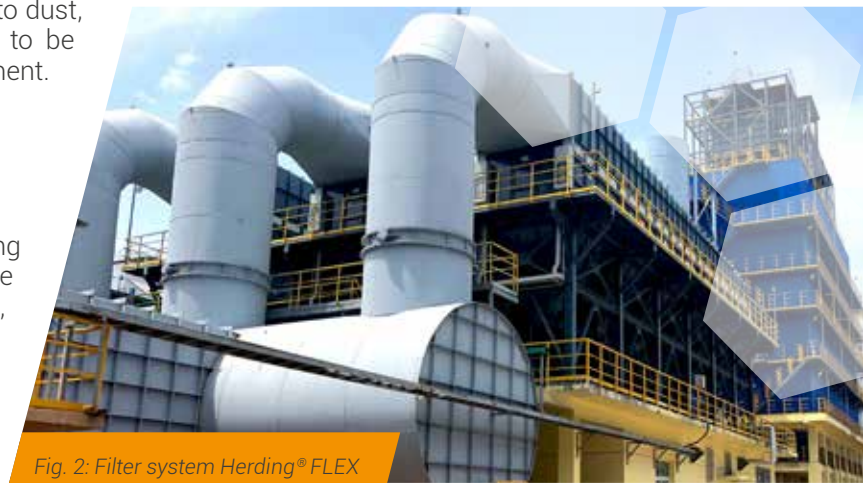
Fig. 2: Filter system Herding® FLEX