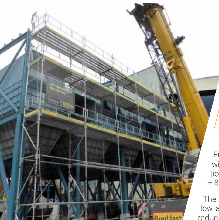
Herding® MAXX filter unit